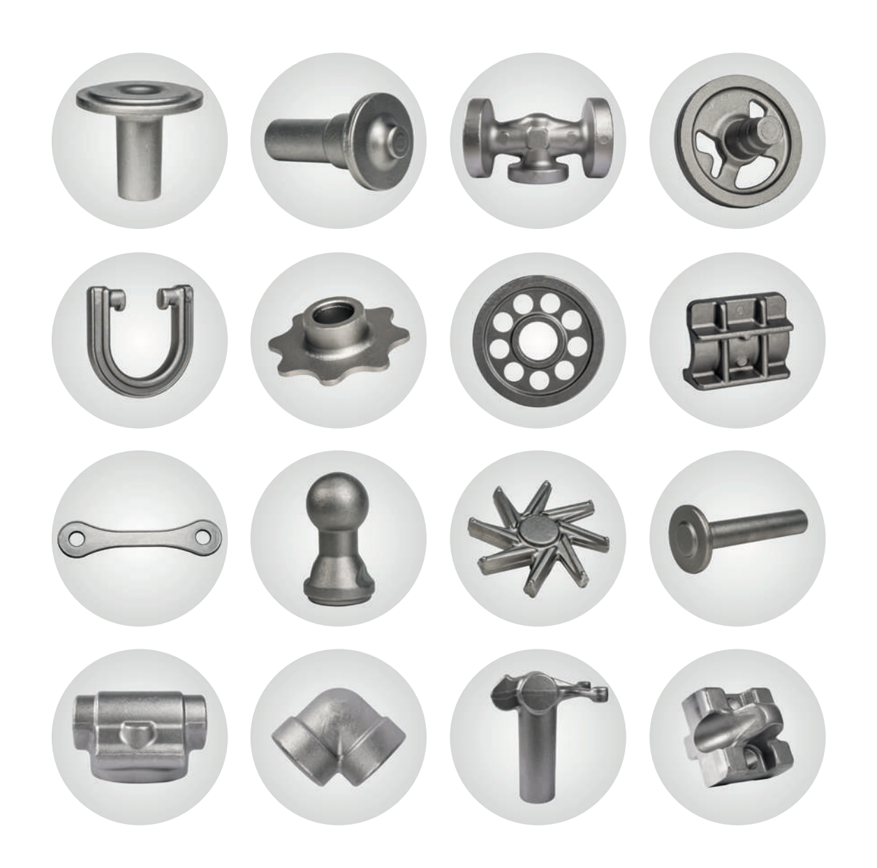
OUR RANGE OF PRODUCTION STARTS FROM 0.5 KG UP TO 120 KG