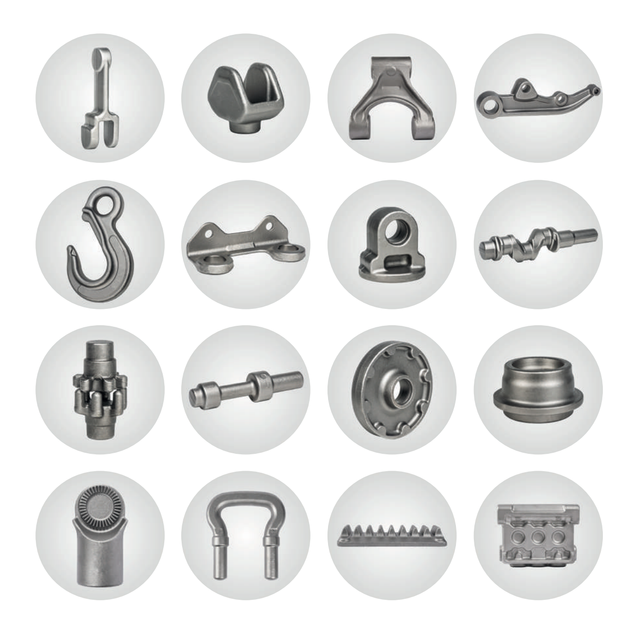
We are specialized in hot forging of carbon, alloyed, stainless steel, duplex, super duplex and special alloys since 1961.